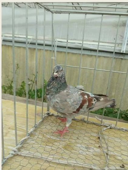
(1) & (4) Stipper plus Ts1 , (2)& (3) dilute ash reds , cock hetero Blue, perhaps Stippers.