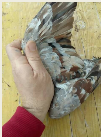
Four photos, Post Ben Rickets.