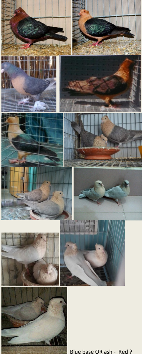
Blue base OR ash - Red ?

(I have not seen any Intense ash-reds in this Breed).