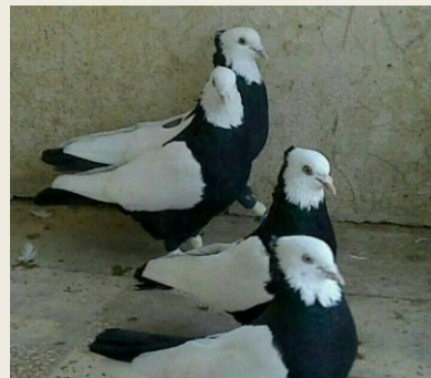
Post by Enes Cetin. ( white wing blacks with bald head design.

Next ( Top left ) , is an interesting progression of the Gimpel Colour Arrangement and similar traits on different Breeds :