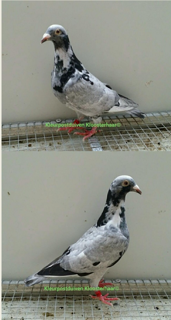
Kleurpostduiven Kloosterhaar Post .