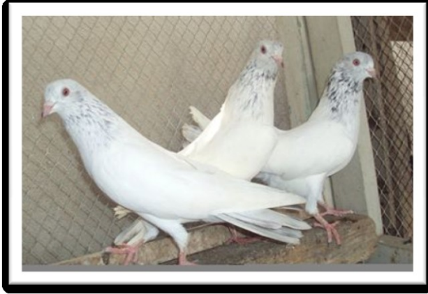
Homo Print Grizzle milky blues - Amin Joyia