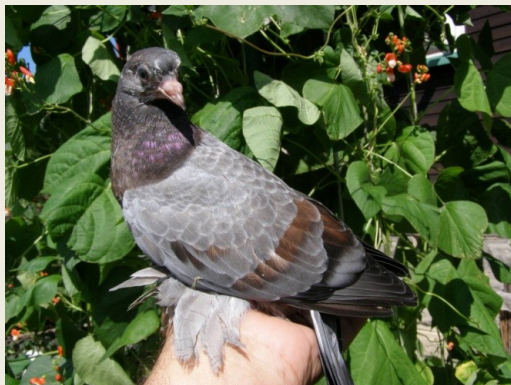
post by Lumir A Anna & Justovi Melbourne appears to be hetero smoky Blue with unknown bronze, ( albescent strips and rump) Not Sooty. Melbourne Pigeon Society FB Group . Smoky is recessive but seems to show in some hetero