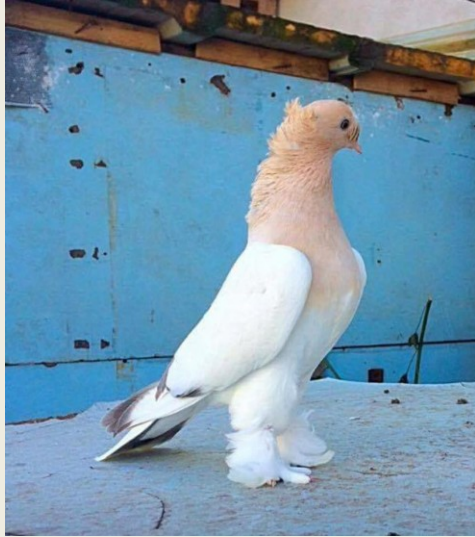
post by Ozay Ozzy Melbourne Soc. Group . Homo Grizzle Ka1 & Ka2. bit suppressed.

specimens, with wide terminal tail band and horn tip beak.