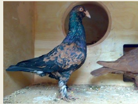
Fancy Pigeons Quetta (unknown trait)