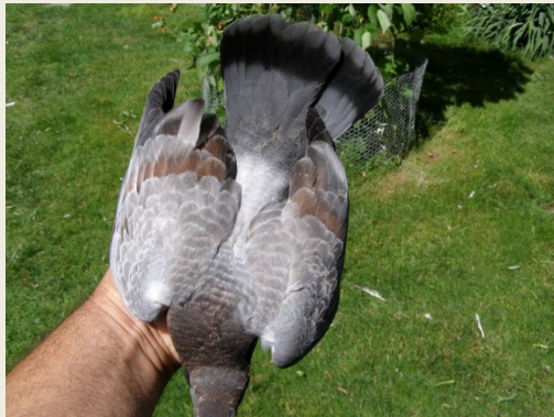
Tiger grizzle by Herve Morey .